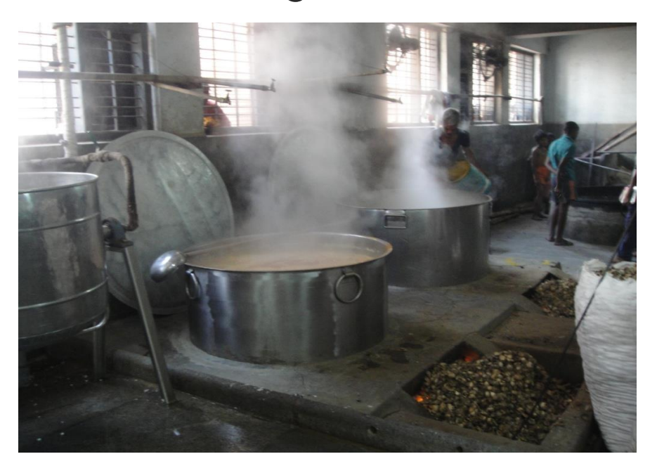
Cooking Millet balls